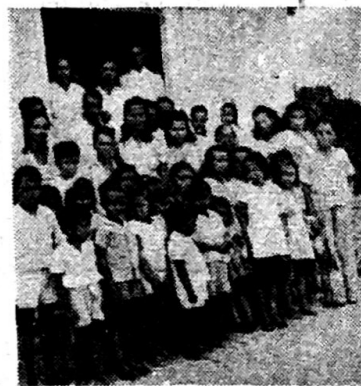
CHURCH AT JAPYNI