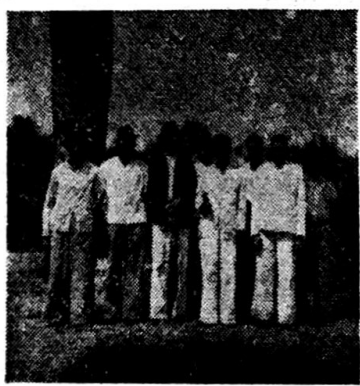
MEN AT JAPYNI