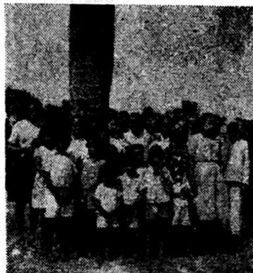
S. S. ATJAPYNI