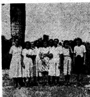
WOMEN AT JAPYNI