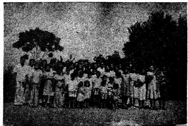
This is group at Campo de Santo where the revival was had for ten days and seven were saved. This is the group that stood on the bank and wept as the preacher left down stream for back home. The Lord willing, we hope to have a church organized at this place someday.