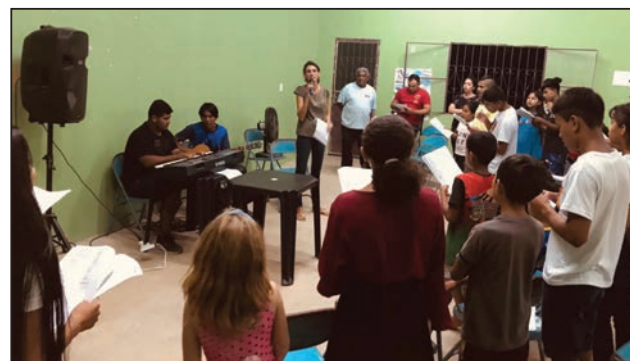
Singing in Ubim