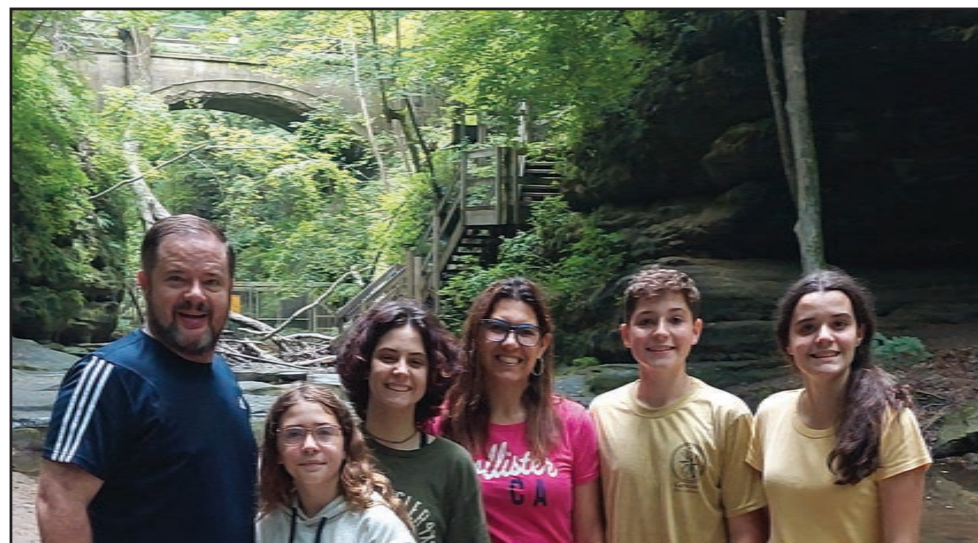
Hiking with the family at Starved Rock State Park, IL