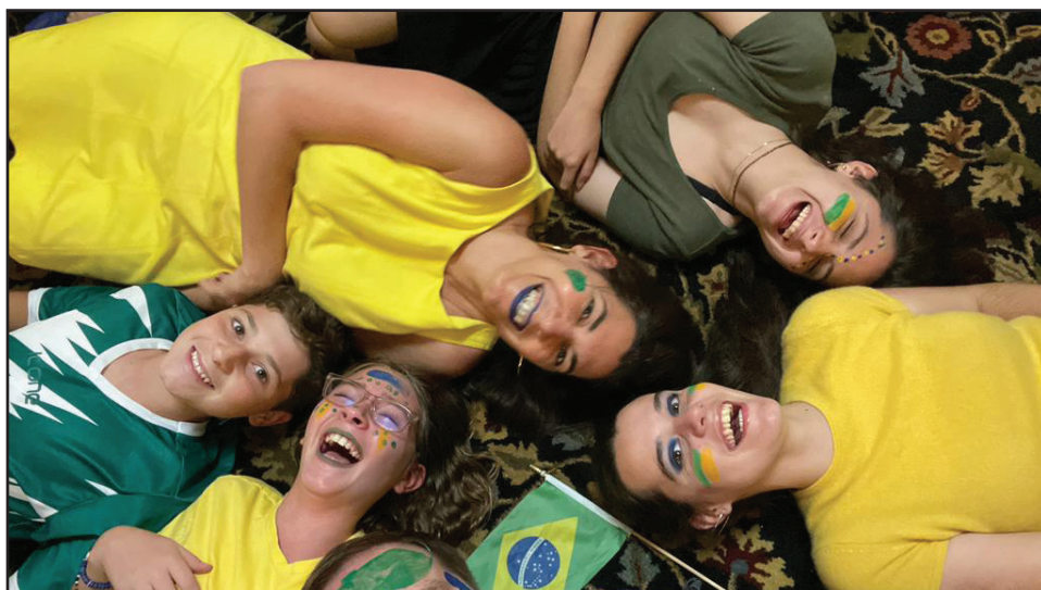
Celebrating Brazil's Independence Day