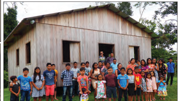
The congregation at the Nukini reservation in front of their new building on Sunday morning.