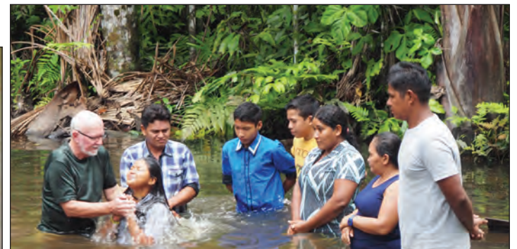
Baptism of Nukinis