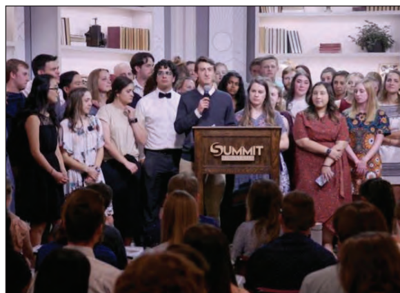
Summit Ministries in Colorado