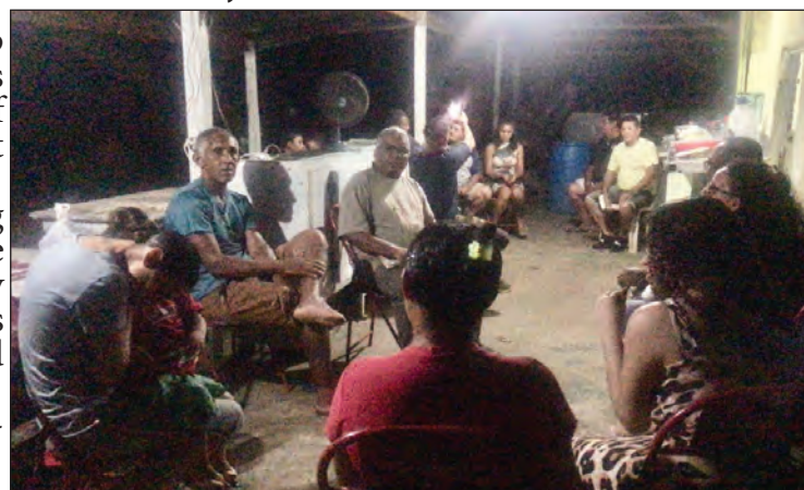
Service in the home of 2 ex-drug addicts they are helping