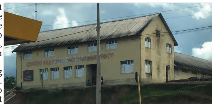
Catholic Seminary where Odali studied before the Lord saved him