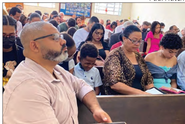
Church in São Paulo