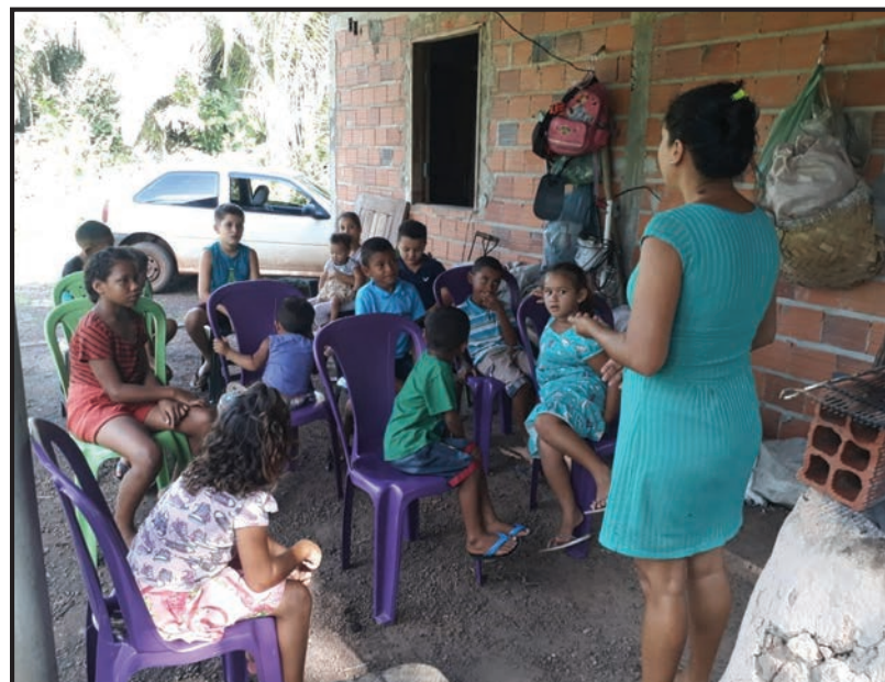
This is the Saturday Bible School in their home at the mission in Maranhão.