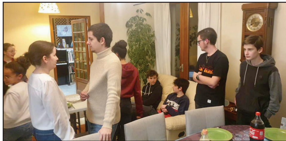
Youth Meeting in France