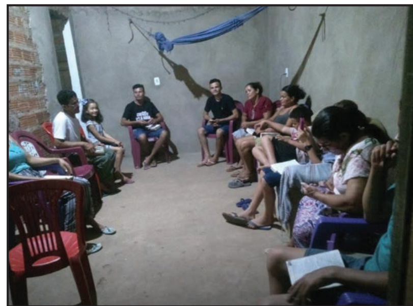
The mission in Maranhão.