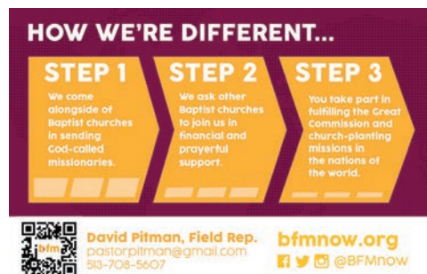
Back of handout card