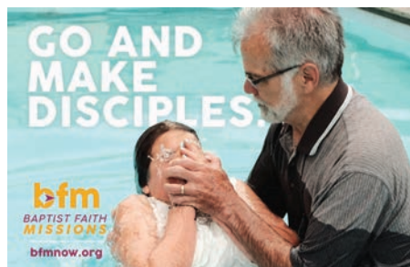
Front of handout card

Here are some sample images from the last Conference.