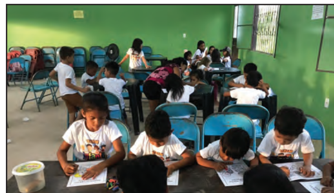
Kids in Ubim with their new t-shirts!