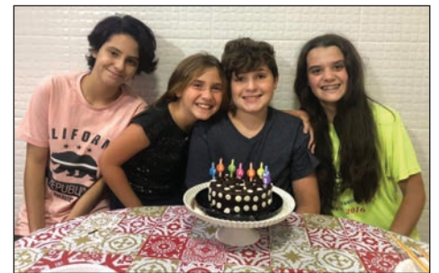
The Hatcher Kids