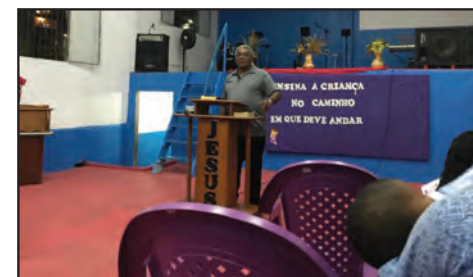
The church they help with fish.

The work in the community of Ubim is back to normal. The number of kids is back to normal with an average of 55-60. Last year we had some tee-shirts made for the kids to use. We would like to make some new ones. If you would like to help, Kathy would be thankful! The cost is 5 dollars per shirt.