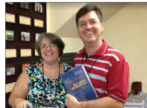
A book they are using in the classes

As I am traveling in Brasil it gives me opportunities to reacquaint myself with the Pastors and to know the problems that they are encountering and the struggles they have to overcome. Before and after