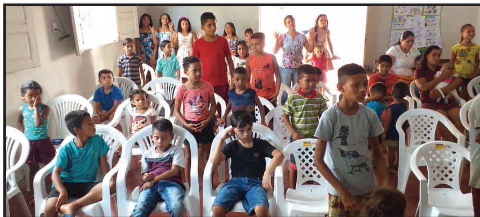
Children in Iranduba

This time of year is a specialty time for fishing. I have been able to take several men to fish and to have some fellowship and to also witness to men that are not saved. This is a way to reach many men around here. God has provided us with a boat and a motor. Also, we have been able to give fish to those who need it and also to pastors and some of their people in need. Last week we took fish to a group that works with Indians, Venezuelans, and an orphanage. This has been a great blessing. Last night I preached at one of these churches we have helped with