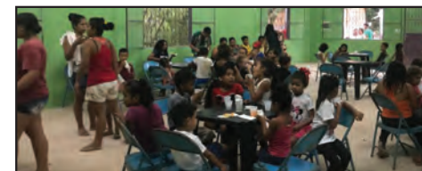
Ubim Children's Day Pizza Party