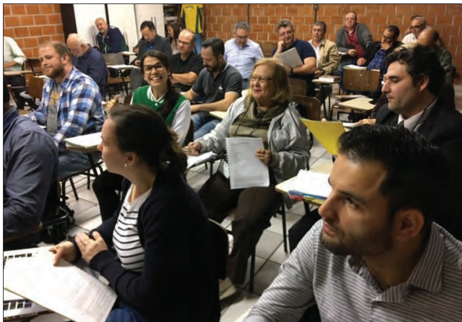
One of the classes from 2019

were hoping for the end of the year; however, that has been delayed until April 2021 now. Our plans now are to purchase our tickets for the spring of 2021 and praying that we do not have to cancel and reschedule again.