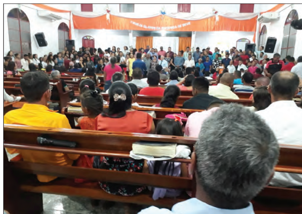
Church at Grande Januáca