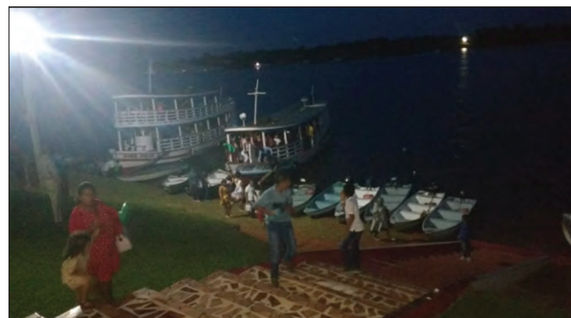
Church parking lot (I mean...boat lot!)

One of the things that everyone there mentioned was that the pastor that was there many years ago always said, "If we serve God, this place will be blessed." The people would say, "How will we be blessed if this place is in middle of nowhere?" Well, they served God and this place is truly blessed. There is probably no other place in the world where 98% of the community are Christians. One of the pastors told me that here in one of the communities called Sumauma, there are 800 people and there are 3 Baptist churches plus 4 other evangelical churches. These churches are not split off from other churches. They have several just because it makes it easier for the people to get to church. The church we went to that night that we were there had 800 that attended the service. That church is in the community called Januáca Grande. These communities have their